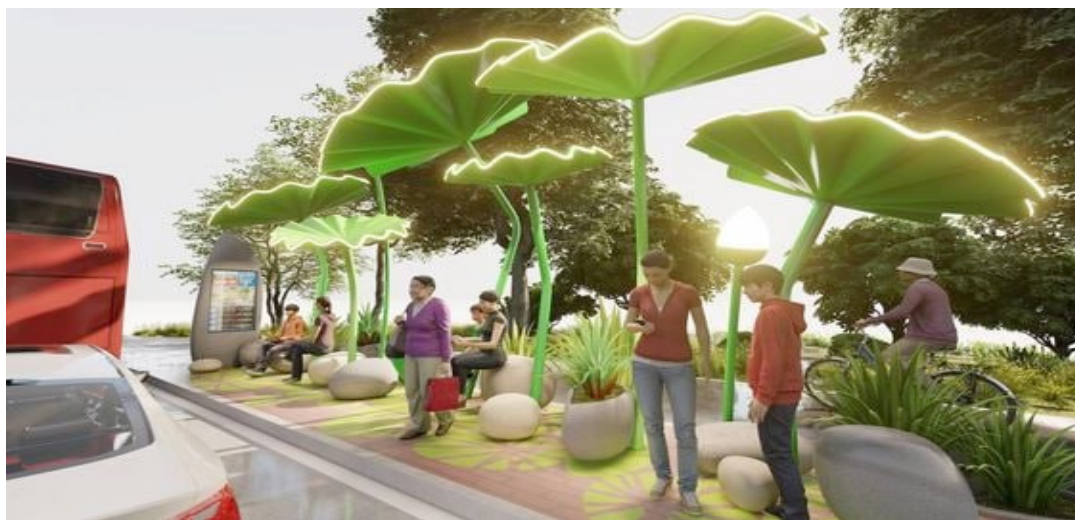
Fig.5: Touristic roadway Tashkent-Djizakh-Samarkand (M39) concept design

Smart tourism plays a significant role in the development of smart cities. A smart city refers to a city that uses technologies and data to improve the quality of life for its residents and visitors. harnesses digital technologies, connectivity, and data to enhance urban operations, services, and sustainability. In the context of smart tourism, a smart city utilizes technology to offer enhanced experiences to tourists and optimize the management of tourist destinations [3].